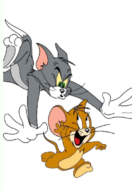
Tom and Jerry