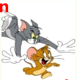
Tom and Jerry

Spiderman can climb up buildings with hands and feet .