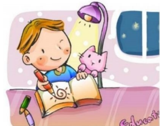
do some homework