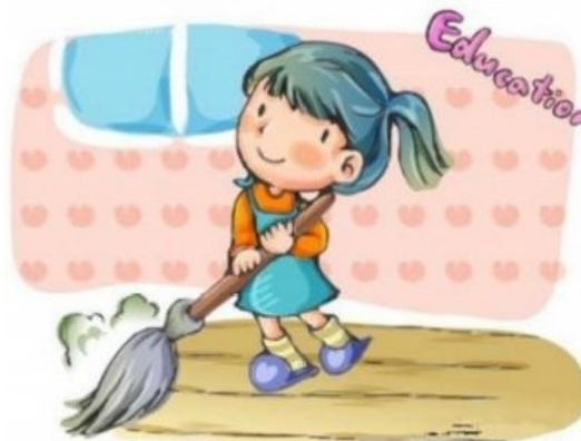
clean the floor