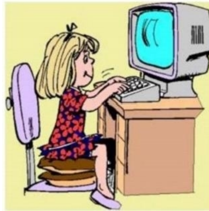
play computer games