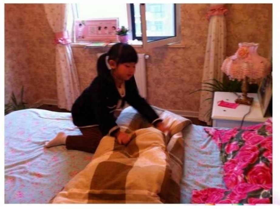
make the beds