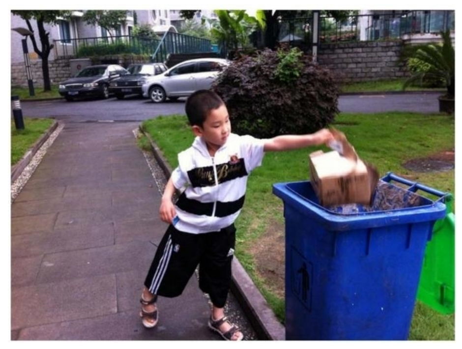
take out the rubbish /garbage