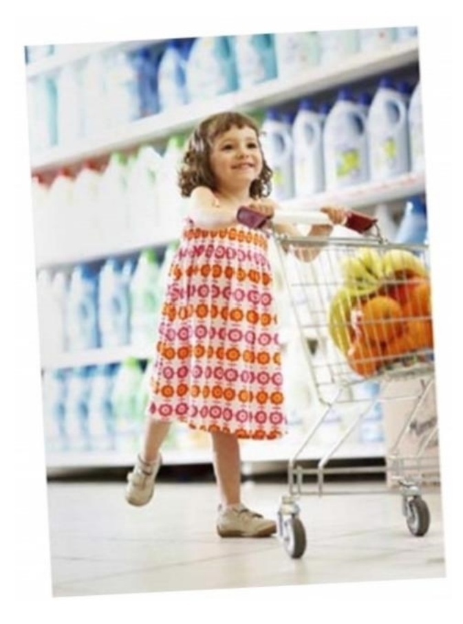
do some shopping