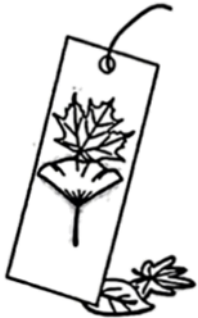
a bookmark with leaves

本题你将听到一段独白, 读两遍。请根据独白内容, 用所听到的信息完成下列各题。(每空不超过三个单词。)