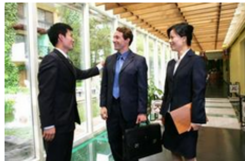
trader n. 商人