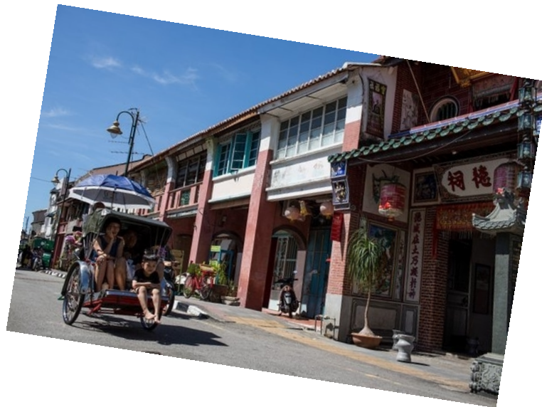
Weld Quay 海墘街