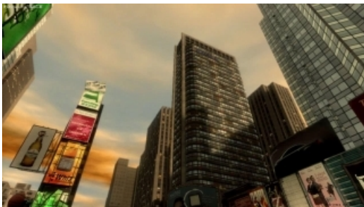
building n. 建 筑物; 房子