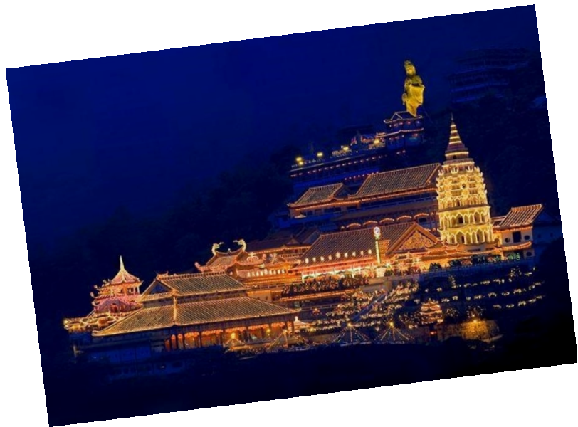
Penang Hill 檳城山