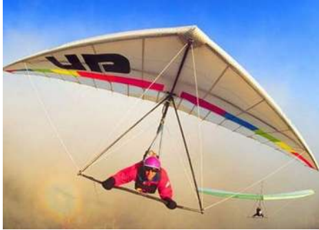
paragliding n. 滑翔伞运动