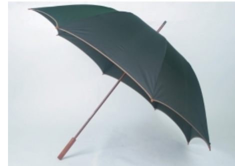
umbrella n. 伞; 雨伞