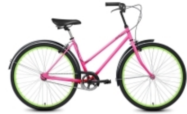
bicycle n. 自行车; 脚踏车