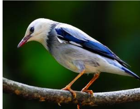
bird n. 鸟