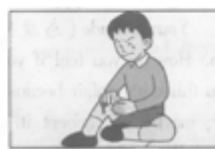
5. sad, because, leg