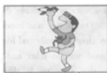
2. pleased, toys