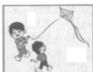
4. fly, now