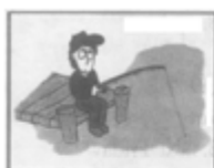
1. often, fish