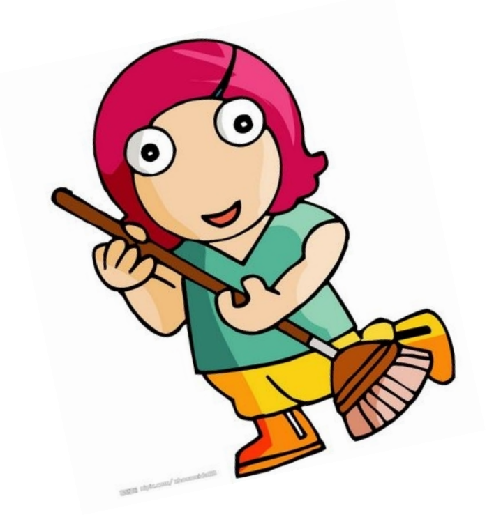
sweep the floor