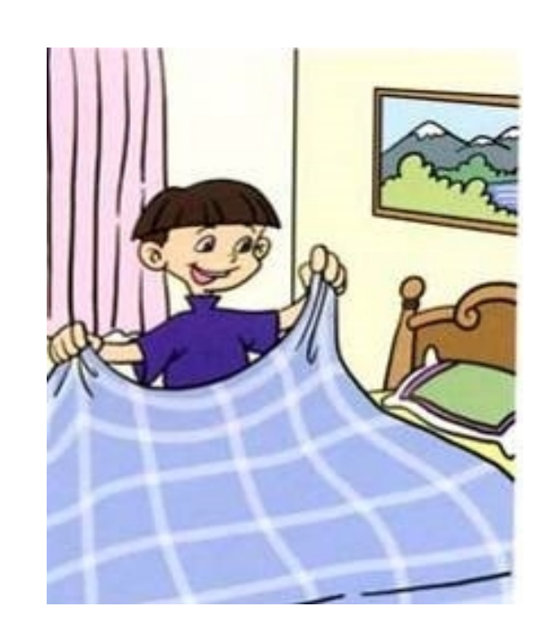
make the bed