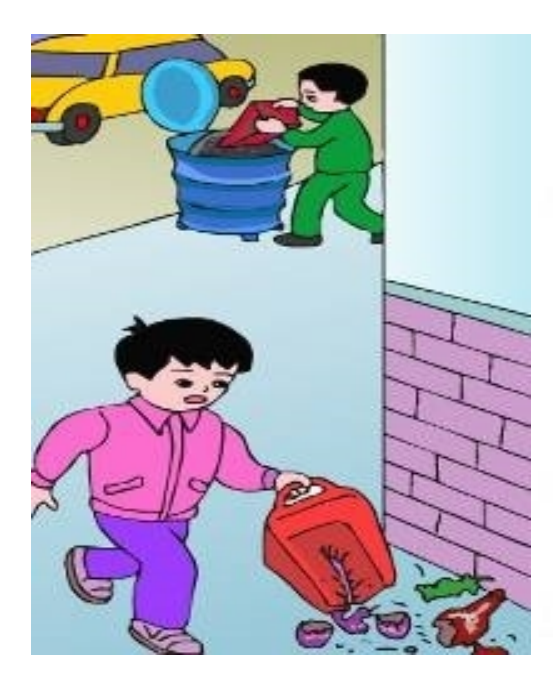
take out the trash