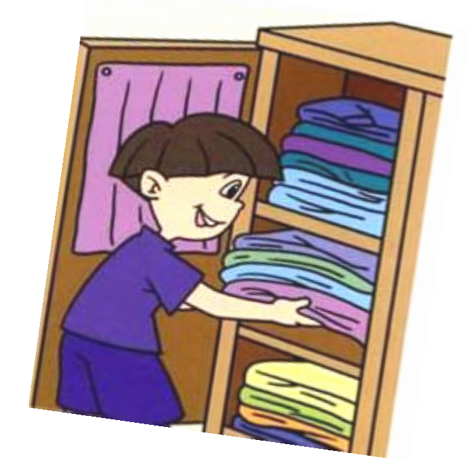
fold the clothes