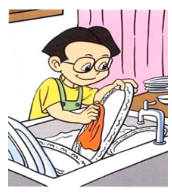
do the dishes