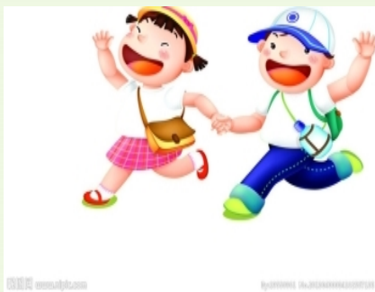
Cousin 堂弟兄、 姐妹