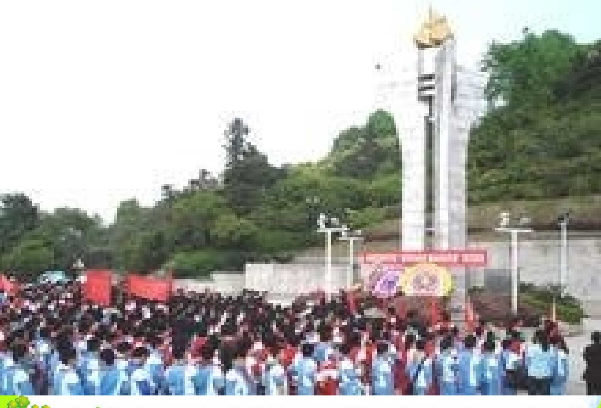
We visited the Monument to the People's heroes.