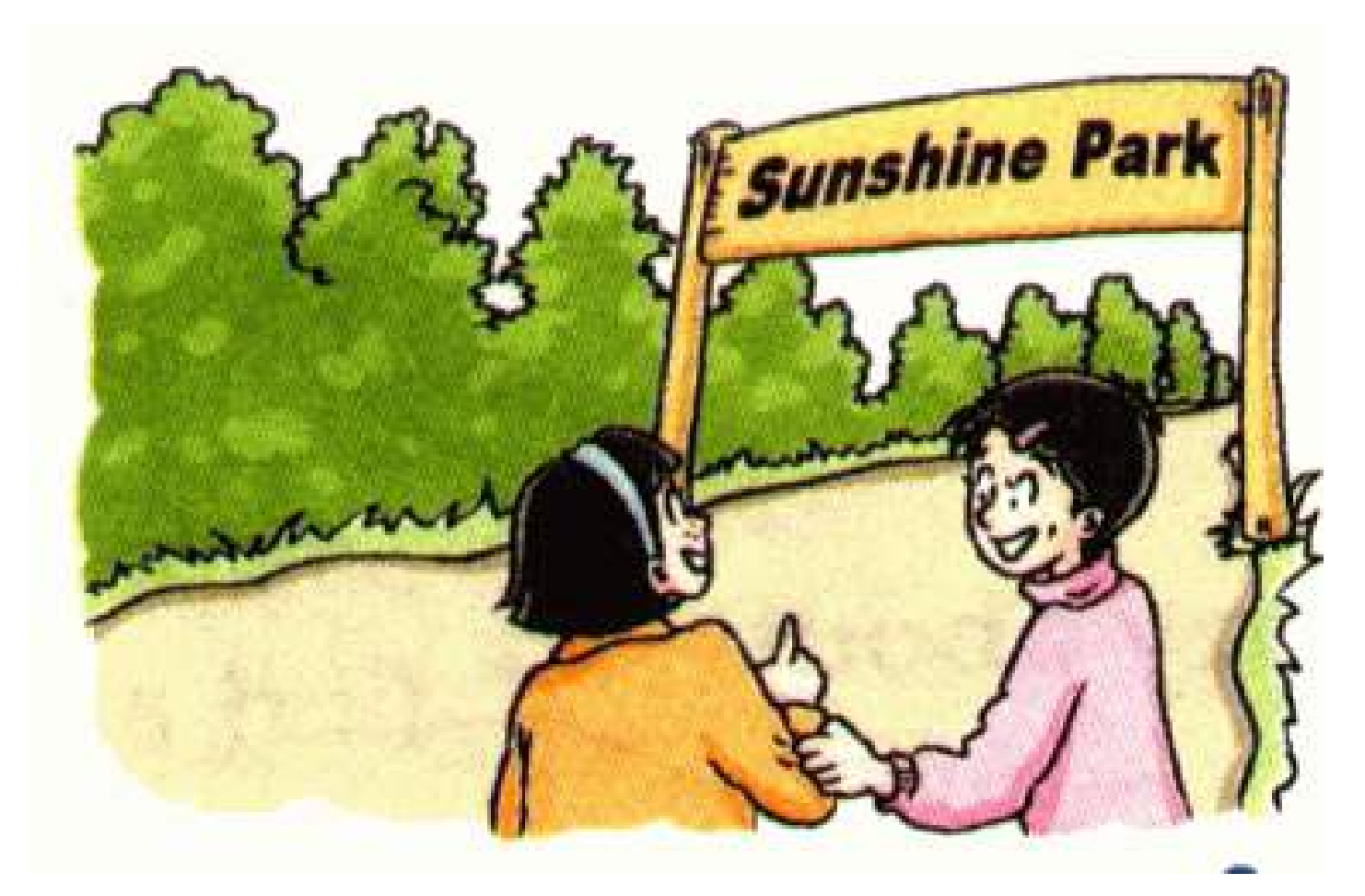
Last Sunday, they went to the park again. 上个星期天, 她们又去了那儿。